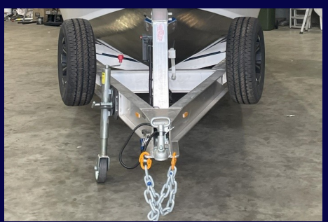
Dual spare wheels