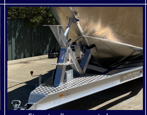
Steps to allow access to bow Checkerplate enclosed front