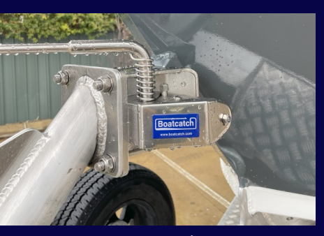
Boat Catch Small or Large