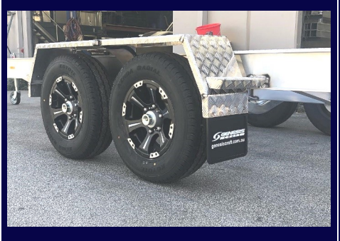
Stainless steel hubs/callipers 4WD Tyres