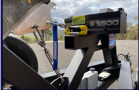
Electric trailer winch