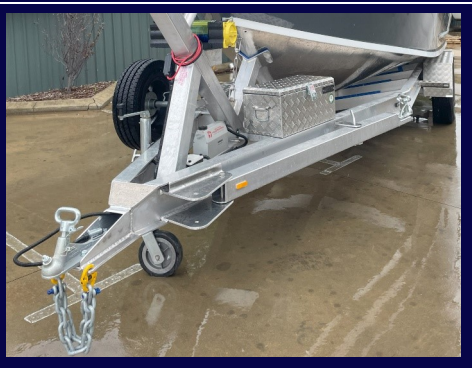
Extended draw bar for beach launching Tool box storage