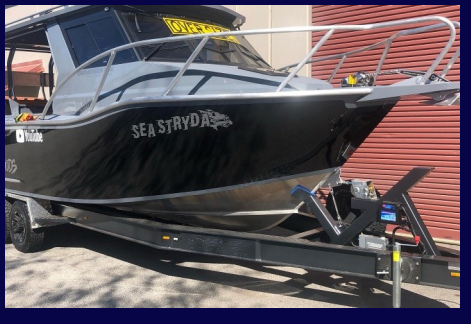
Primed/ powder-coated frame