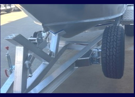
Drop down spare wheel carrier